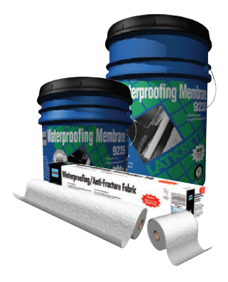
Performance Level: BEST Warranty: 10 Year Refer to Data Sheet 236.0 Antimicrobial Product Protection