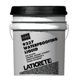
Performance Level: GOOD Refer to Data Sheet 641.0

NOTE: LATICRETE® 9237 Waterproofing Membrane liquid is applied in 2 coats. Coverage varies based on substrate texture, porosity, and application technique.