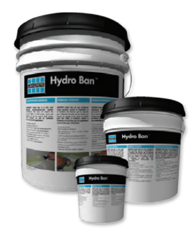
Performance Level: BEST Warranty: 10 Year Refer to Data Sheet 663.0 Antimicrobial Product Protection